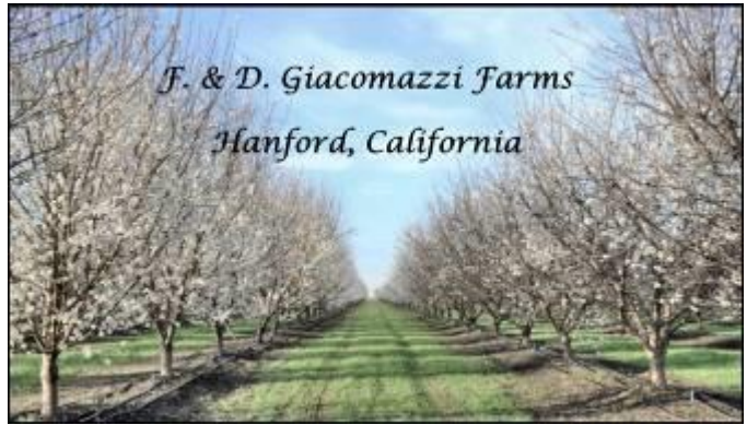
F. & D. Giacomazzi Farms Hanford, California